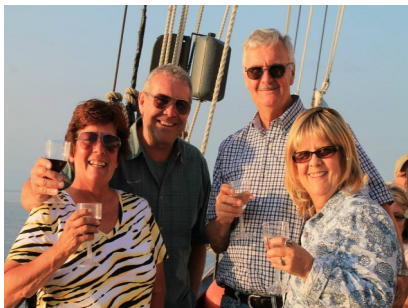
Sunset dinner aboard the Appledore Tallships