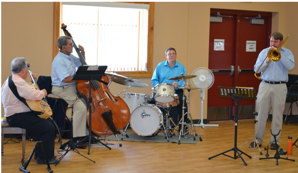
The entertainment was provided by “The Usual Suspects.” They did a great job keeping everyone happy and moving.