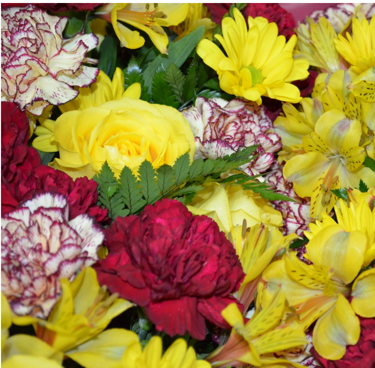
The beautiful flowers were provided by Norm’s Flower Petal. The colors were amazing and added to the room decor.