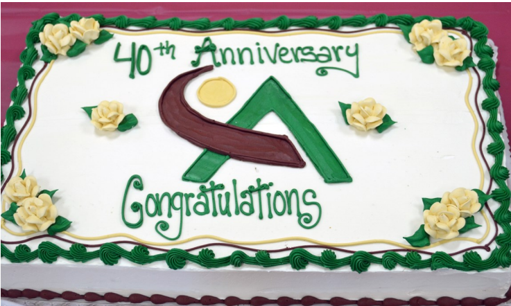
The cake and cupcakes, furnished by Robaire’s Bakery, were without question a special taste treat.